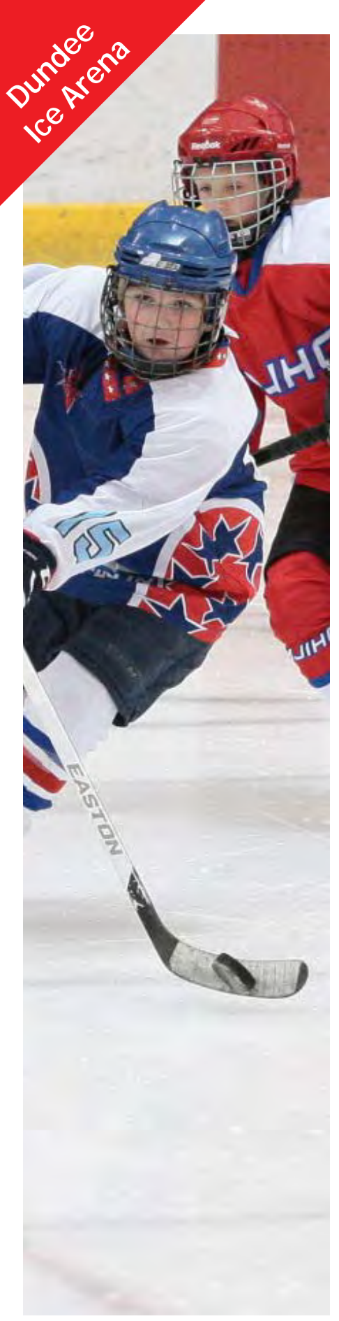
Leisure & Culture Dundee is a Scottish Charitable Incorporated Organisation No. SC042421