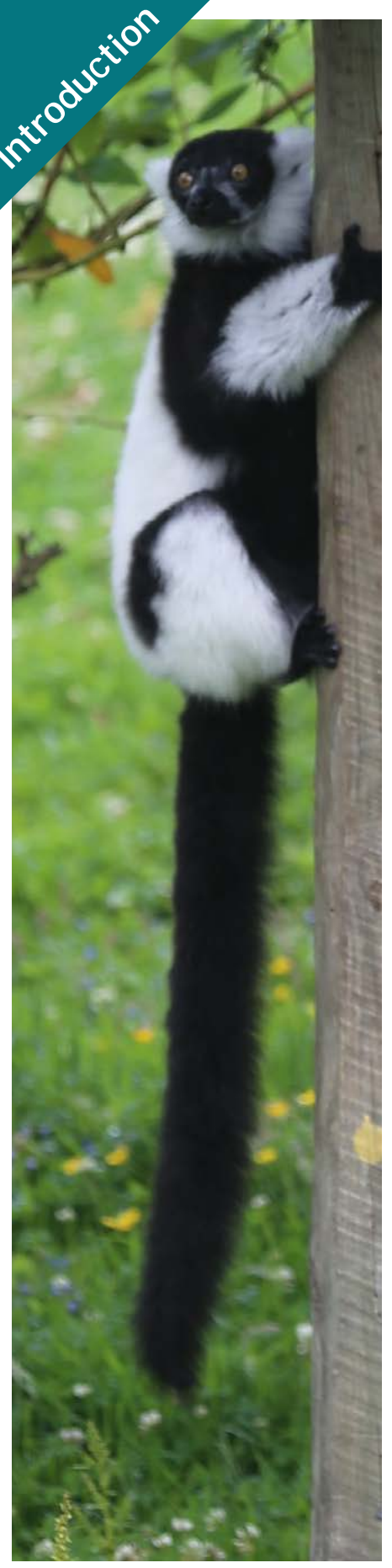
Leisure & Culture Dundee is a Scottish Charitable Incorporated Organisation No. SC042421

There were almost 575,000 attendances at Olympia, Lochee and Community Swim and Sports facilities. The Olympia Swim Centre remains our most popular facility with some 400,000 visitors. In 2014/15 we offered a more diverse range of activities, such as Water Polo, Canoe Polo, Diving, Sub Aqua and Aqua Fit, which complement our regular programme of club and public swimming and swim lessons.