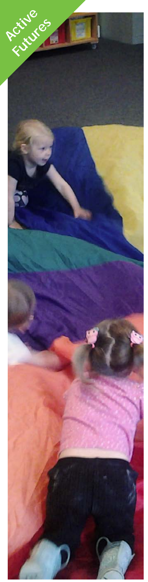
Leisure & Culture Dundee is a Scottish Charitable Incorporated Organisation No. SC042421