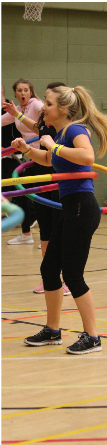
Leisure & Culture Dundee is a Scottish Charitable Incorporated Organisation No. SC042421