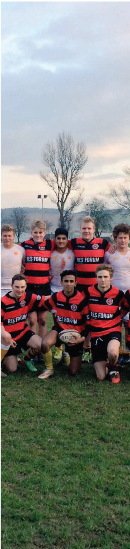
Leisure & Culture Dundee is a Scottish Charitable Incorporated Organisation No. SC042421