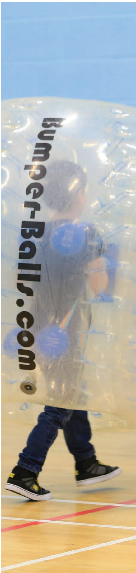
Leisure & Culture Dundee is a Scottish Charitable Incorporated Organisation No. SC042421