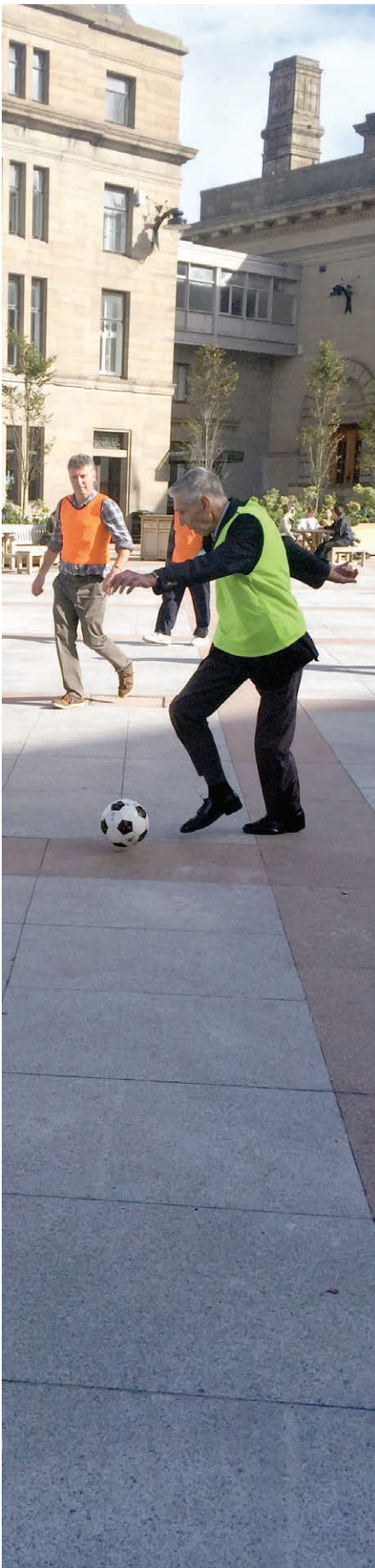
Leisure & Culture Dundee is a Scottish Charitable Incorporated Organisation No. SC042421