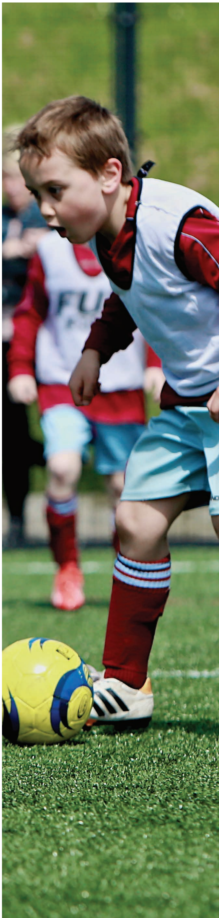
Leisure & Culture Dundee is a Scottish Charitable Incorporated Organisation No. SC042421

on Saturday mornings and provided a comprehensive winter indoor programme across three sports centres involving over 150 players.