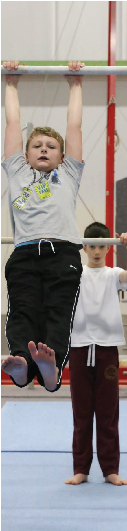
Leisure & Culture Dundee is a Scottish Charitable Incorporated Organisation No. SC042421