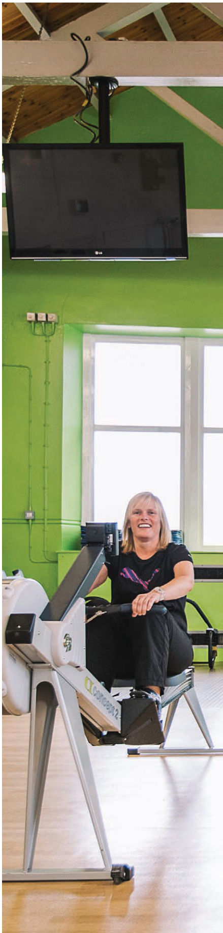
Leisure & Culture Dundee is a Scottish Charitable Incorporated Organisation No. SC042421