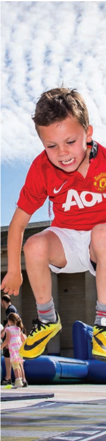
Leisure & Culture Dundee is a Scottish Charitable Incorporated Organisation No. SC042421