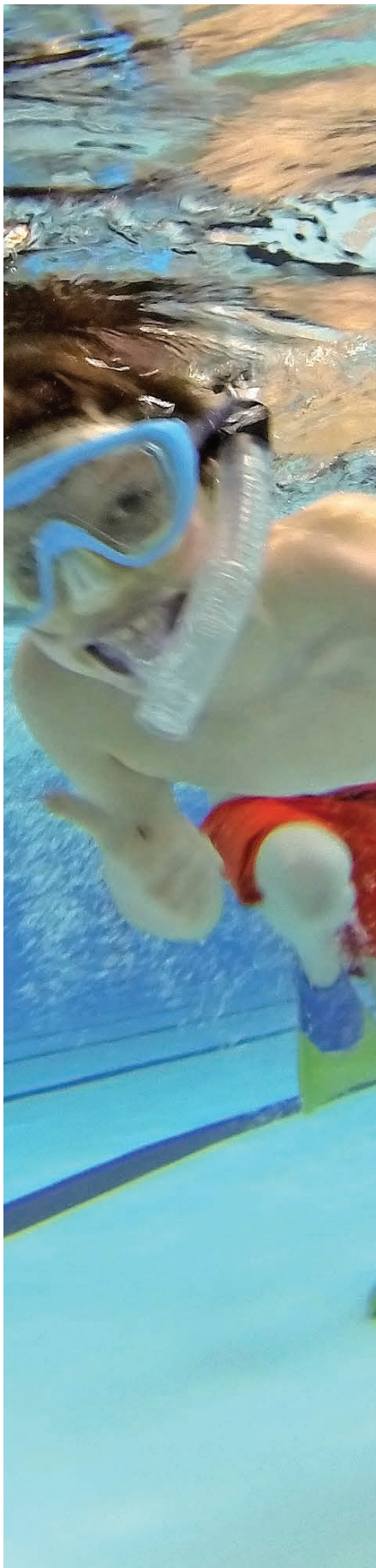
Leisure & Culture Dundee is a Scottish Charitable Incorporated Organisation No. SC042421