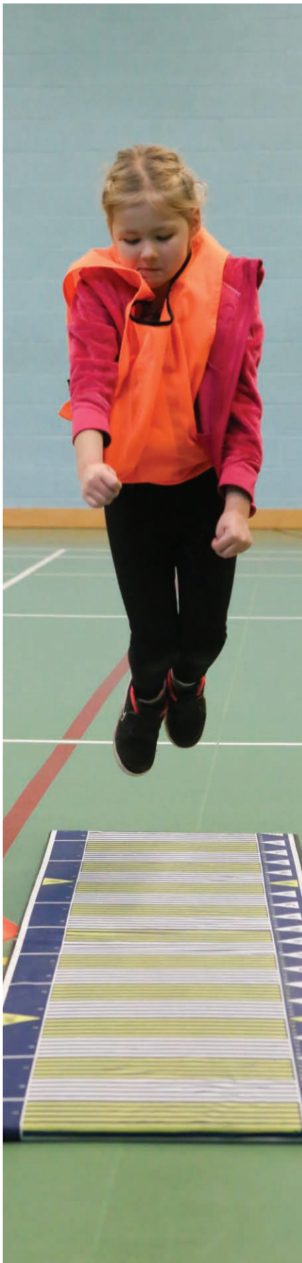
Leisure & Culture Dundee is a Scottish Charitable Incorporated Organisation No. SC042421