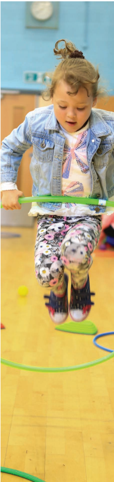
Leisure & Culture Dundee is a Scottish Charitable Incorporated Organisation No. SC042421

Our excellent results are down to the hard work and creativity of staff. Despite challenging financial and economic conditions and testing operational situations, the doors were kept open and great opportunities offered to people from Dundee and the wider area. Whether it be learning to swim, keeping fit, socialising with friends, recovering from illness or trying to beat a personal best, the Leisure and Sport staff made sure they were ready to help.