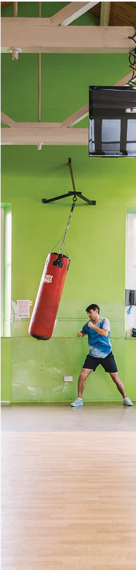
Leisure & Culture Dundee is a Scottish Charitable Incorporated Organisation No. SC042421