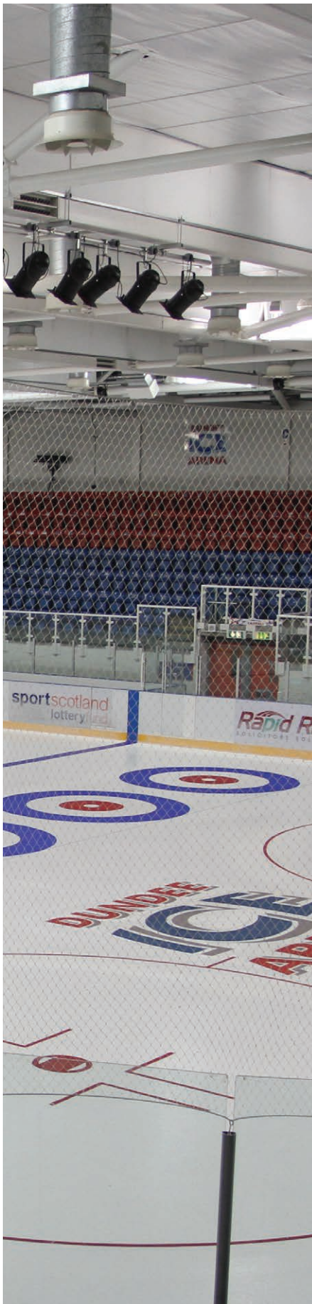
Leisure & Culture Dundee is a Scottish Charitable Incorporated Organisation No. SC042421

Additional services, including the brand new Nerf Wars event, which attracted 115 young people and 100 spectators on the day, and the Family Fun sessions have proved very successful and this will be repeated in the coming year.