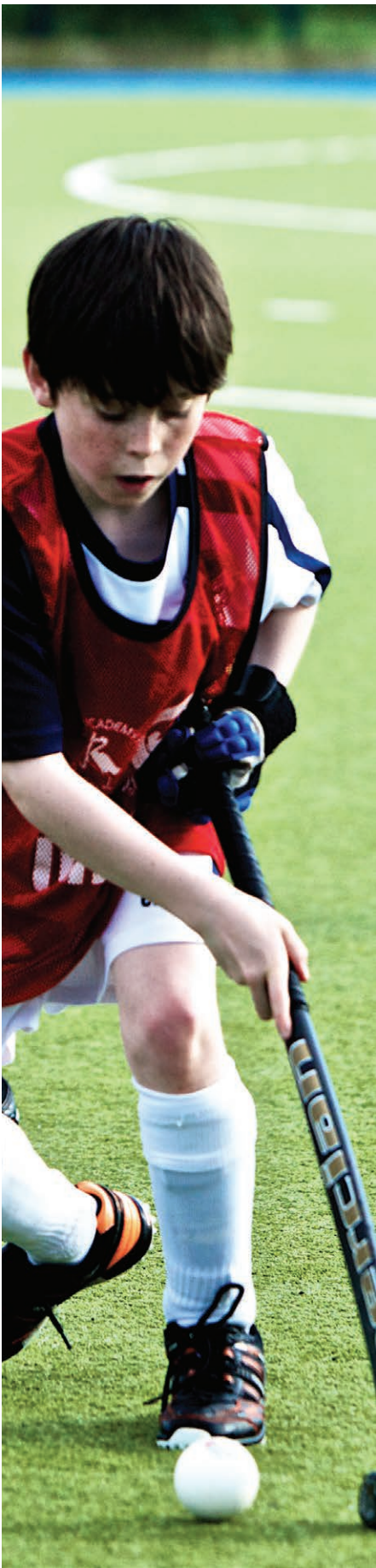
Leisure & Culture Dundee is a Scottish Charitable Incorporated Organisation No. SC042421