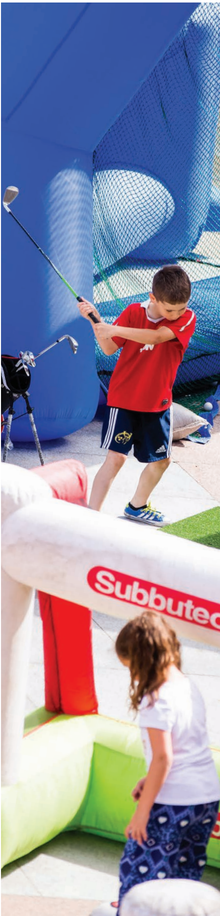
Leisure & Culture Dundee is a Scottish Charitable Incorporated Organisation No. SC042421