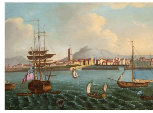
Unknown Artist, Dundee from the River, 1793

Drop in and learn about this small but fascinating collection of early painted views of Dundee.