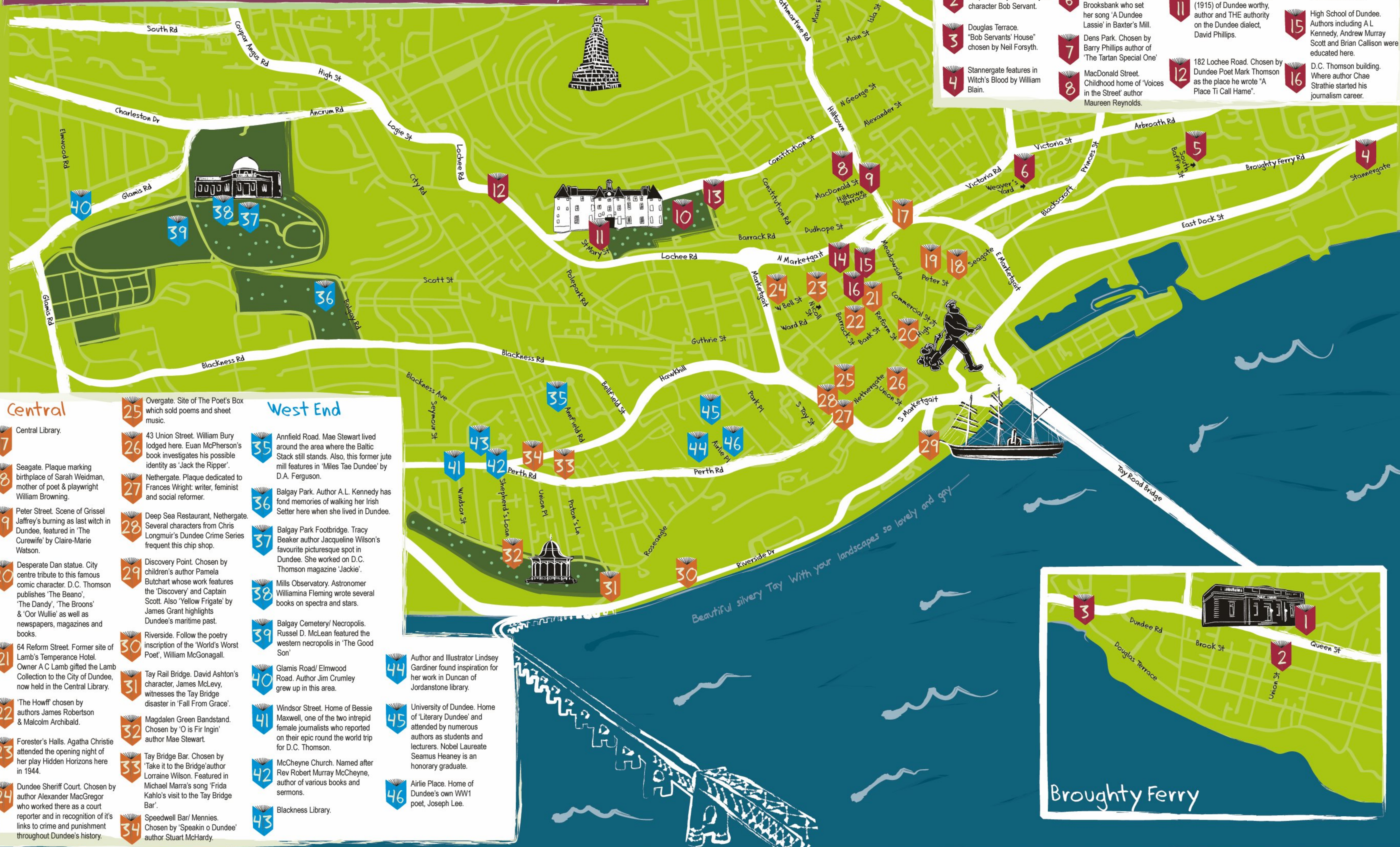
Illustration by Dawn Irvine