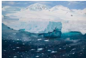
Frances Walker, Late Summer, Antarctica © The Artist's Estate

The most fragile landscapes on earth are the subject of our latest exhibition. Among the Polar Ice brings together two major